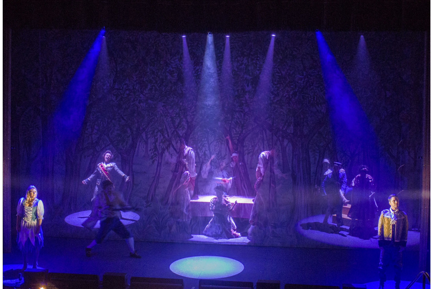
Robe LED is Perfect Fit for Cinderella