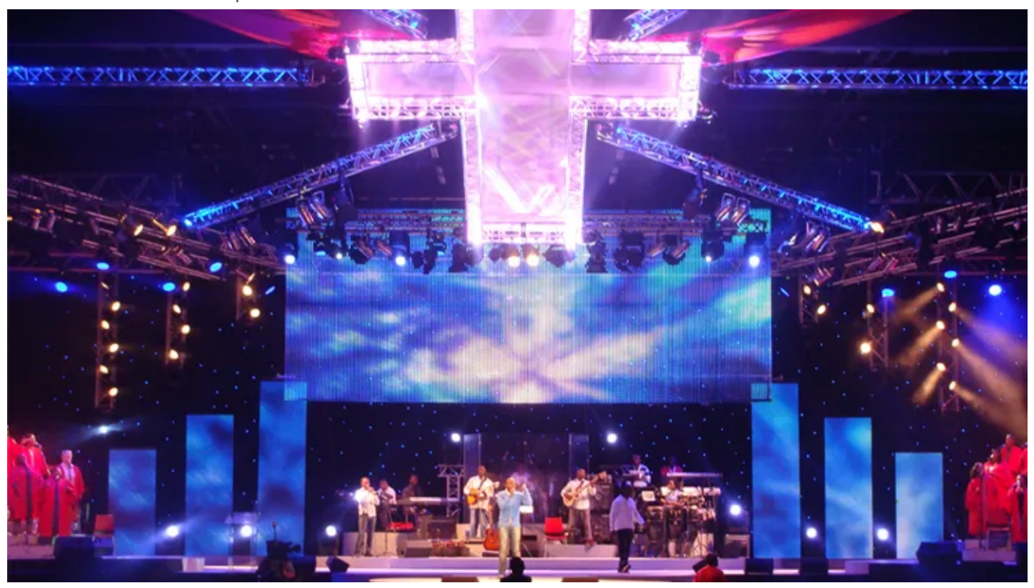
The 2011 Crown Gospel Music Awards was recorded for later broadcast on SABC.